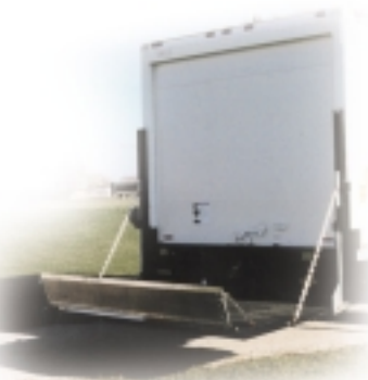
Optional retention ramp